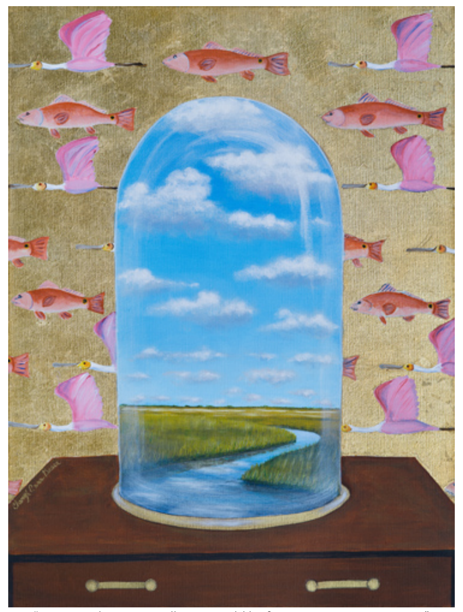
"Preservation #2" acrylic, 24K gold leaf on canvas, 18" x 24" x 1.75"

I grew up in South Carolina, an only child, living with my grandmother in her home along with my divorced mother. Both of them worked; neither had much time for me. My grandmother was a drapery maker and worked six days a week, at home. I spent my days playing in the huge scrap boxes under her sewing table with nothing but my imagination to entertain myself. It was a solitary childhood, but it fed my imagination.