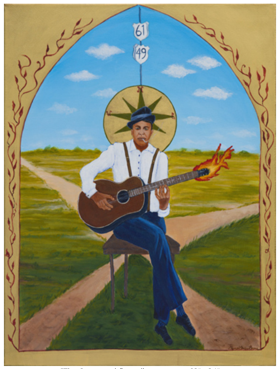
"The Crossroads" acrylic on canvas, 18" x 24"

I've experimented with subject matter since my early beginnings, focusing on what I knew, landscapes of the Southeast. I now paint stories, and the titles of my paintings are usually an integral piece of the story. Although I have refined my detailed style, my subject matter is inspired by my move to New Orleans fifteen years ago.