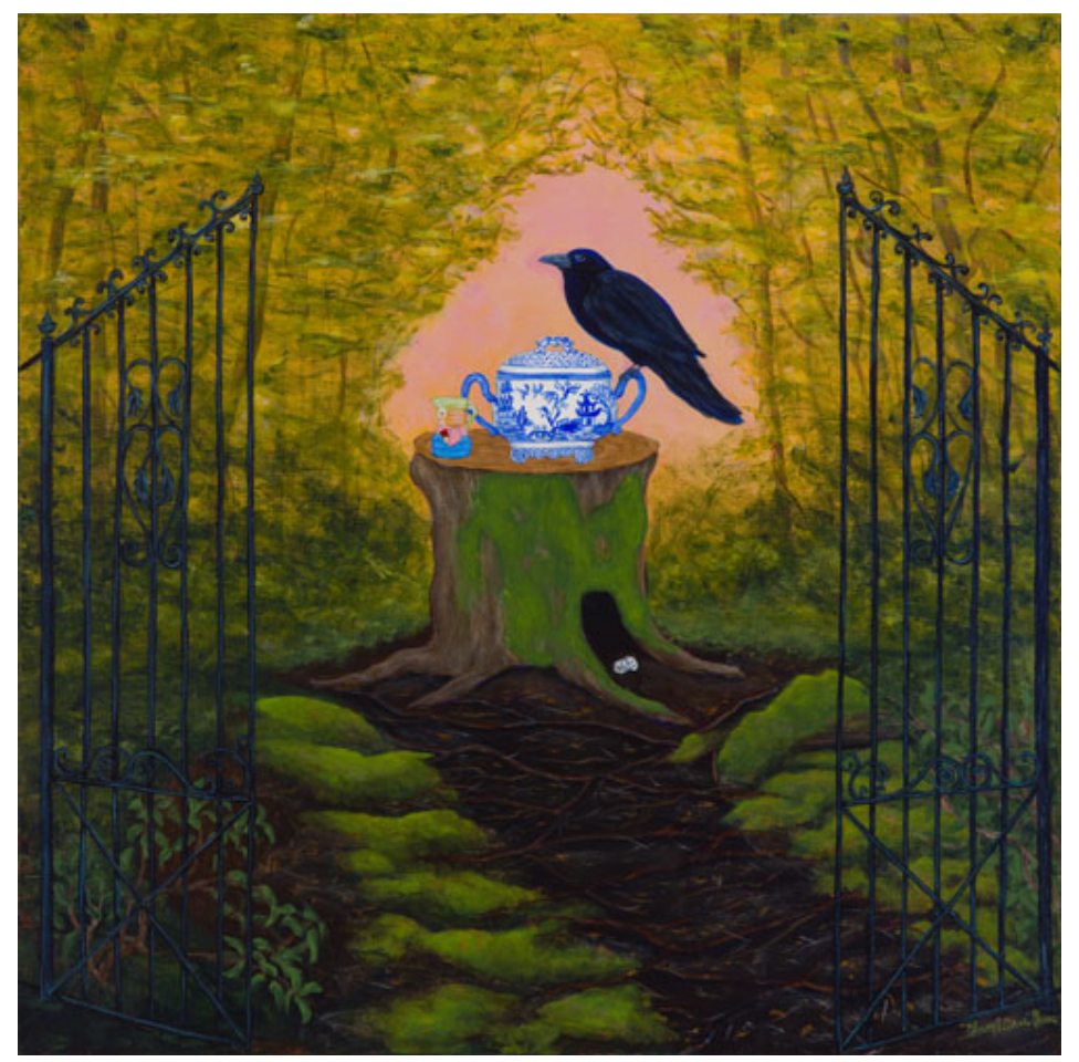
"The Homecoming" acrylic on canvas, wood floater frame, 24" x 24"

My work is recognizable by my detailed style and the bold palette that I have developed over many decades. My subject matter is extremely diverse, but often I work in a series, sometimes adding to a series over years. I paint everything from architecture to landscapes and people, sometimes in a representational way and other times combined in imaginary settings. My primary challenge is perspective because I am mildly dyslexic. It can be a struggle, so at times I diverge from traditional perspective if that works for a particular piece.