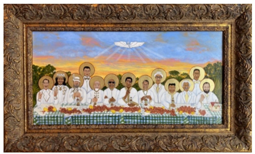
"Last Supper on the Bayou" acrylic on canvas, framed 19" x 31"

It has evolved to encompass magical realism, visionary imagery, and often humor, drawing on my heritage, marrying past and present, using symbolism and metaphors. My love affair with Louisiana has deepened. That is something I intend to explore in some future work, primarily the French Cajun culture of the Atchafalaya Basin.