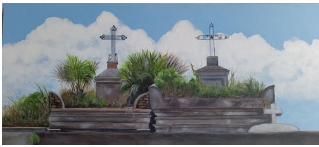
"Unbroken, Saint Louis Cemetery" acrylic on canvas, 15" x 30"

It has evolved to encompass magical realism, visionary imagery, and often humor, drawing on my heritage, marrying past and present, using symbolism and metaphors. My love affair with Louisiana has deepened. That is something I intend to explore in some future work, primarily the French Cajun culture of the Atchafalaya Basin.