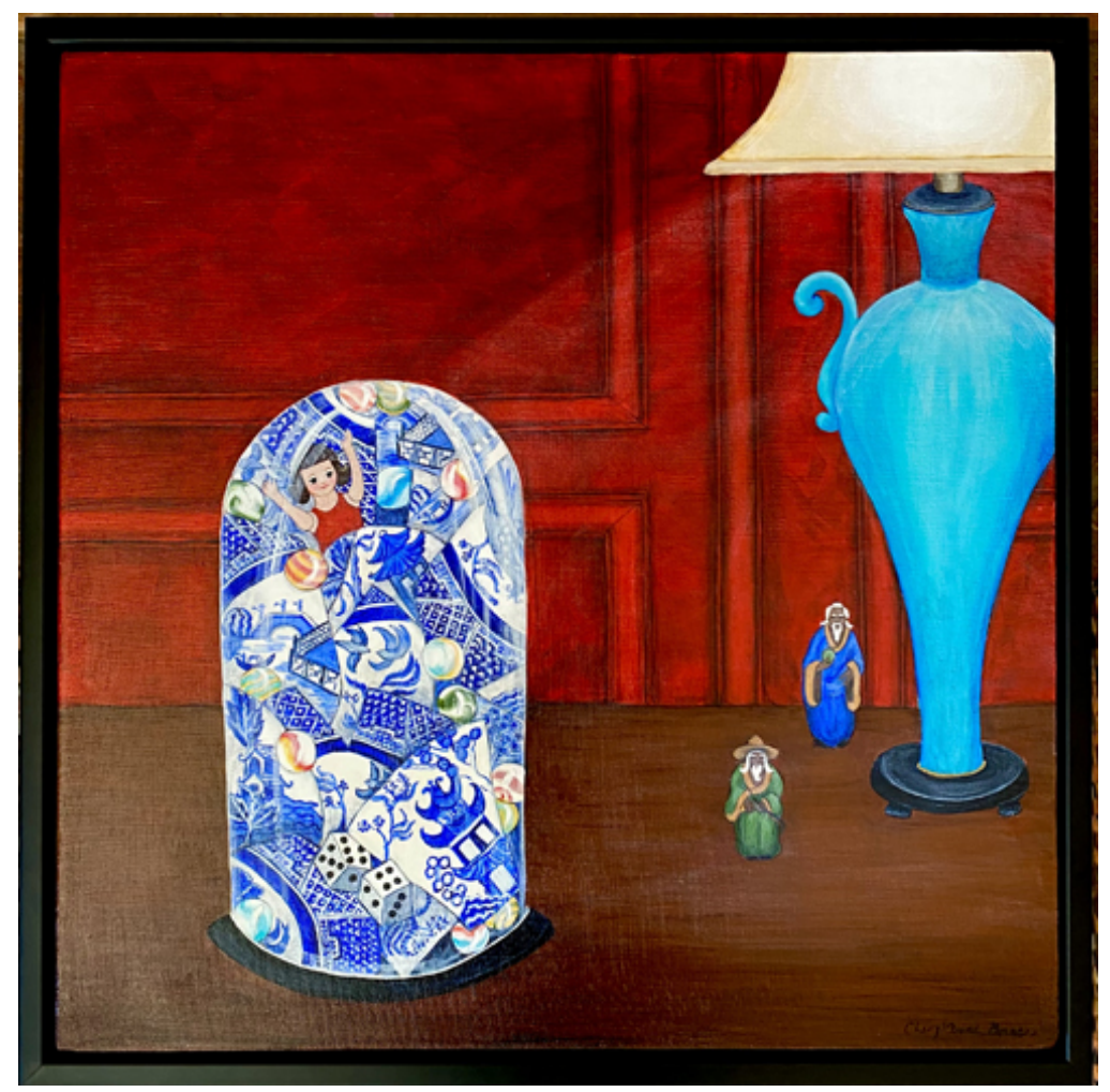
"Keeping It All Together" acrylic on canvas, wood floater frame, 20" x 20"

I work exclusively in my studio, referencing multiple photos out of my vast library of my photographs as well as research images relevant to what I'm painting. I work in acrylic on canvas or smooth artist panel, sketching, then underpainting the outlines in a dark color. On ready-made stretched primed canvas, I start with several layers of gesso and sand between each layer to create a smooth surface. Acrylic paint is applied in countless thin layers with no visible brush strokes, followed by transparent glazes and finished with gloss varnish.